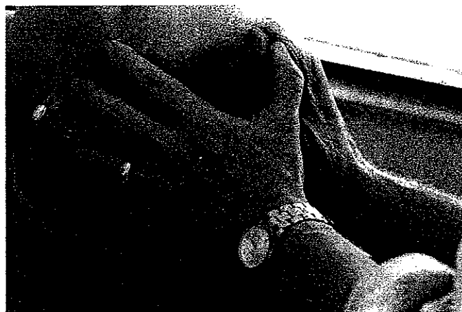
During a session you can expect a slight pressure on your head or some other area of your body. The hands are held there, often without moving, until the practitioner feels a release.