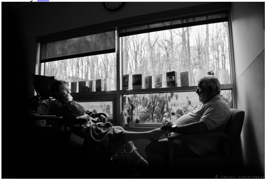
by Parker J. Palmer (@ParkerJPalmer), Columnist

Wednesday, April 27, 2016 - 5:00am