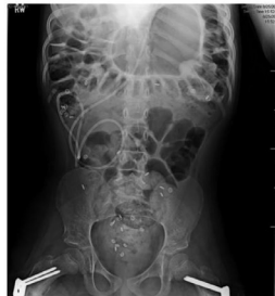
Abdominal Xrays with radiopaque markers before and after treatment regimen

Patient 1 is Case A and Patient 2 is Case D.