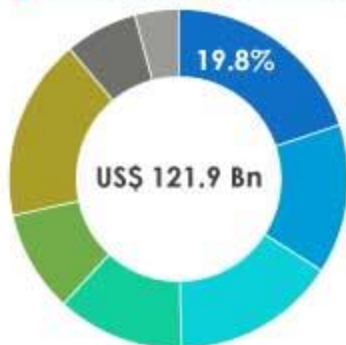
Market Share by Service (2022 E)