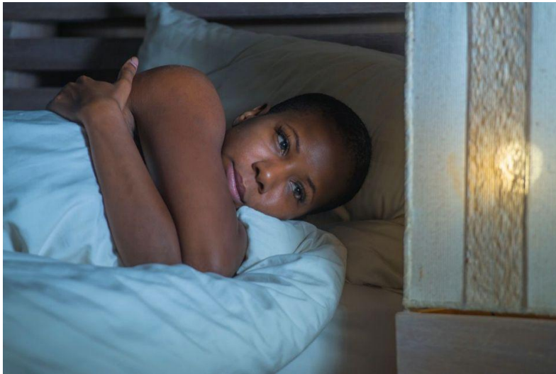
sad and depressed black african American woman in bed sleepless late night feeling desperate looking worried and anxious suffering depression problem and insomnia sleeping disorder

Many long haulers have trouble sleeping, explains Fauci.