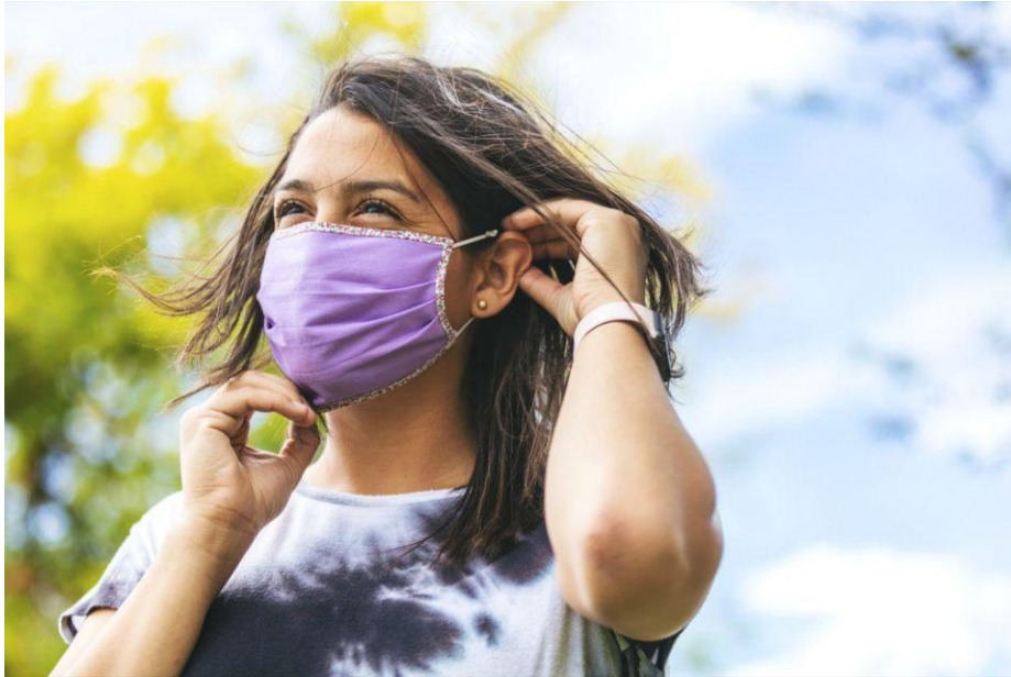
Female Wearing Face Mask and Social Distancing

Observe Fauci's fundamentals: Wear a face mask , social distance, avoid large crowds, don't go indoors with people you're not sheltering with, practice good hand hygiene and, to protect your life and the lives of others, don't miss the full, extended list of Sure Signs You've Already Had Coronavirus .