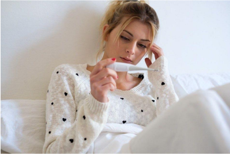
Sick woman with fever checking her temperature with a thermometer at home

Fauci explains that a phenomenon called dysautonomia, or autonomic dysfunction, can be one symptom. "Dysautonomia refers to a group of medical conditions caused by problems with the autonomic nervous system (ANS)," reports the Cleveland Clinic . "This part of your nervous system controls involuntary body functions like your heartbeat, breathing and digestion. When the ANS doesn't work as it should, it can cause heart and blood pressure problems, trouble breathing and loss of bladder control.