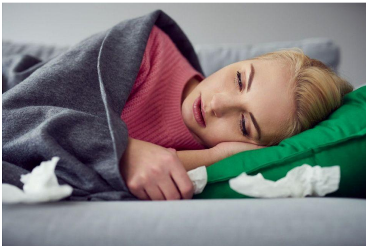
Woman suffering from cold, virus lying on the sofa under the blanket

While fatigue is one of the initial symptoms signaling an infection, the majority of long haulers continue to experience overwhelming exhaustion long after the virus is gone, per Dr. Fauci.