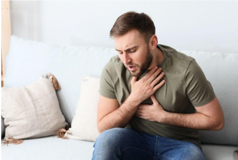
Young man having asthma attack at home

Shortness of breath is another trademark symptom of COVID-19, per the CDC. However, if the difficulty breathing doesn't subside, it could signify long hauler syndrome. "People who are in good shape, athletes, have trouble climbing a flight of stairs," Fauci explained.