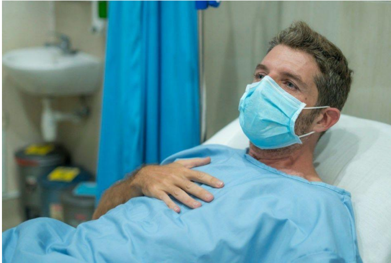
adult male in face mask receiving treatment at hospital suffering respiratory disease lying on bed

Fauci added that there is another type of long-term health damage that has been documented in COVID survivors who suffered more severe cases of the virus. "If someone goes in the hospital with COVID, they get difficulties breathing, they get intubated and put on a ventilator. They get pneumonia when they recover, because they have such damage to their lungs or sometimes to their heart or to their kidney," he explained. "It may be months and months, and maybe even longer — because we don't know yet because we've only been doing this for less than a year — where they have organ system dysfunction that is residual, maybe indefinitely."