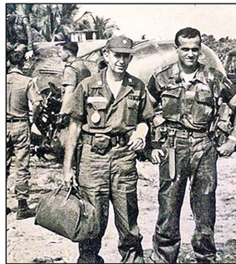
Then Captain Loeffke (right without a cap) walked away from a helicopter crash, where two soldiers died from head wounds during the 1960s. The crippled helicopter is in the background.

Burn Loeffke is a retired military officer, has been wounded, survived two parachute malfunctions and two helicopter crashes in combat.